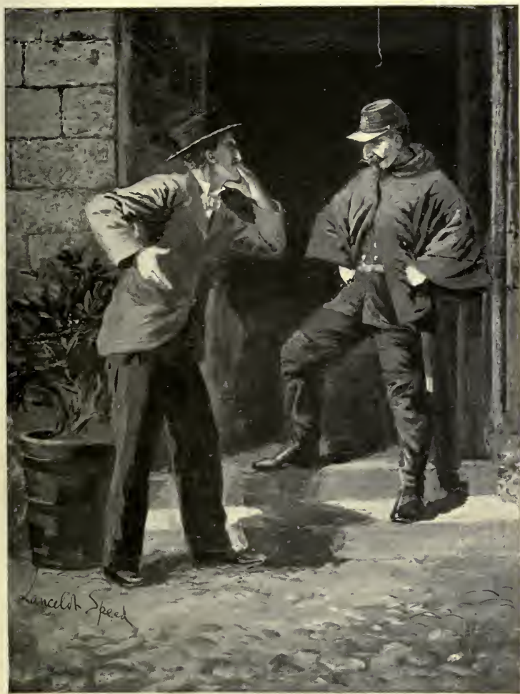
THE CORD DANGLED ABOUT A FOOT ABOVE THE POLICEMAN'S HEAD.—Page 25.